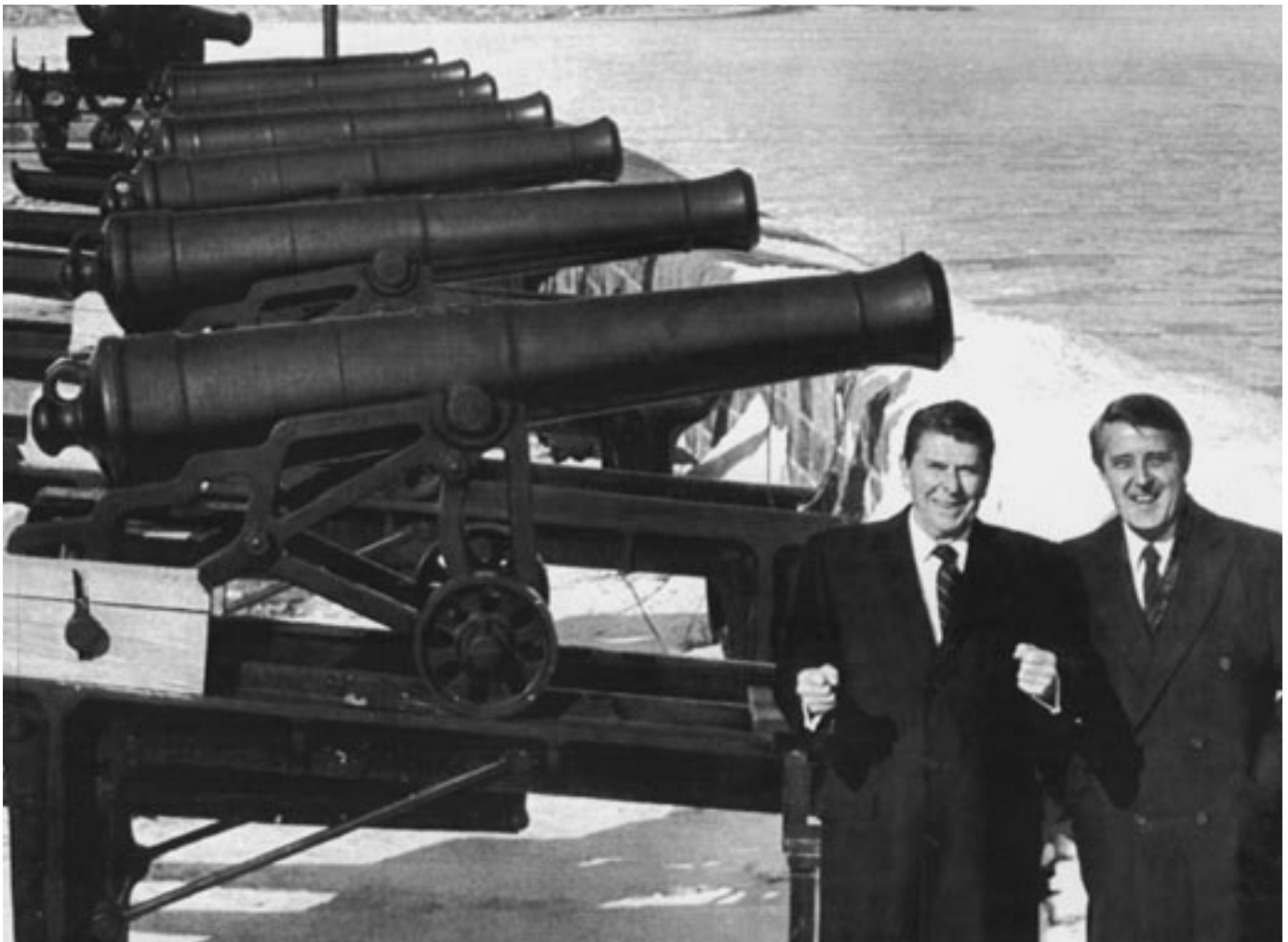
The Gazette, Montreal

Concern over maritime borders was not all that surprising for a country with by far the longest coastline in the world. What is more surprising is that, in the inter-war years, Canada did not draw any distinction between imperial interests and Canadian ones. It was the British who defined our