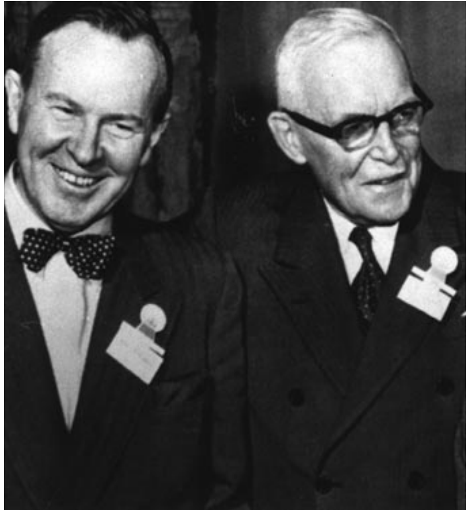
The Gazette, Montreal

The Chrétien government’s approach to foreign policy was to be characterized first by a profound lack of coherence, then by an increased anti-American inflection which led us to adopt a quixotic international role, notably different from the heyday of