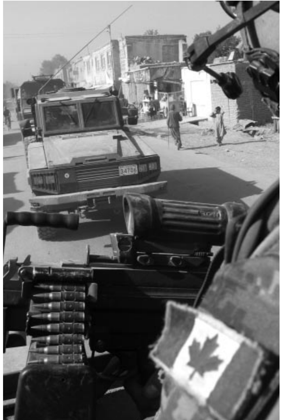
Frank Hudec, Canadian Forces

stalled. The NATO expansion plan, established after the Istanbul Summit in June 2004, divided Afghanistan into four zones: north, west, east, and south. OEF already had PRTs in all four zones. In principle, NATO ISAF was to replace OEF in the northern sector and, over