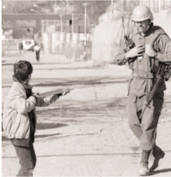
Canadians remain supportive, at least ..

We observe that public opinion on peacekeeping tends to be stable over time and reacts in reasonable and predictable ways to external events.