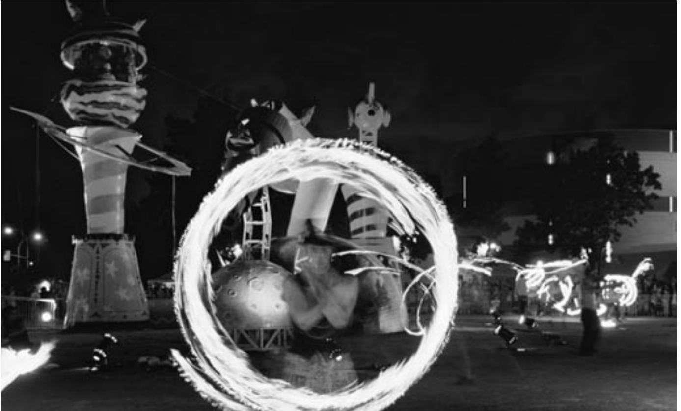
Alain Laforest, Tohu

The Falla in Saint-Michel, a new tradition at Tohu. According to Simon Brault, "Tohu illustrates the unparalleled power of the arts and culture to mobilize people and to spawn new development strategies that can respond to citizens' needs as well as community and socioeconomic concerns."